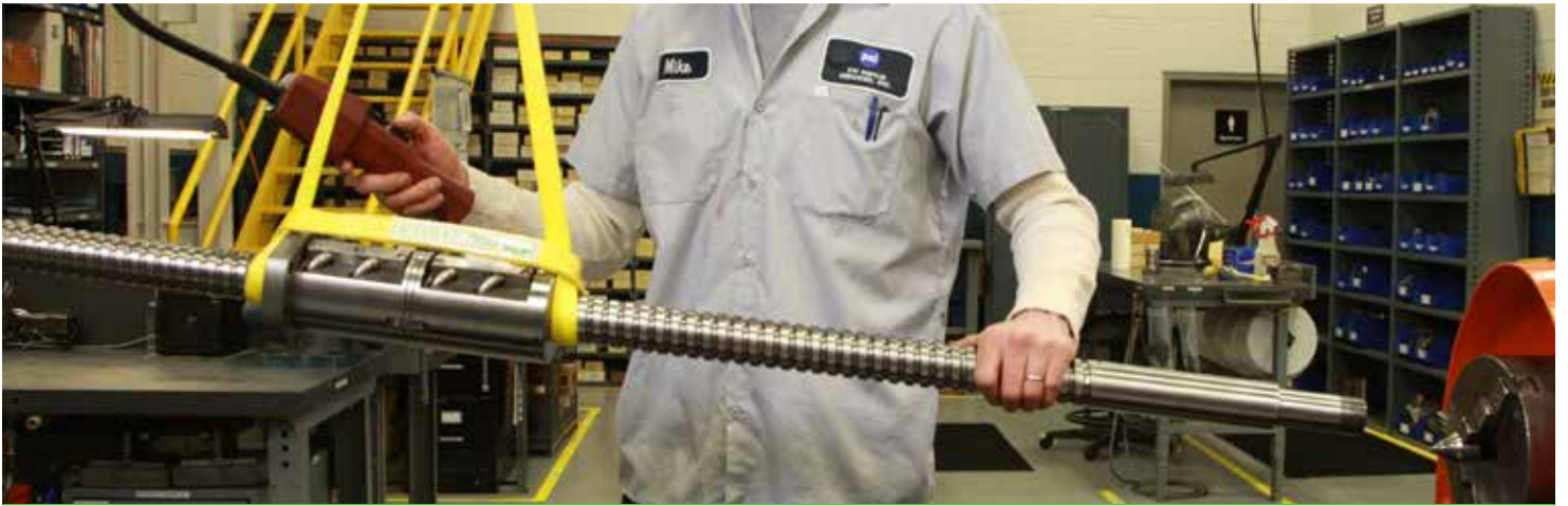
PSI Repair Services, Inc. has 56,500 square feet of repair space.