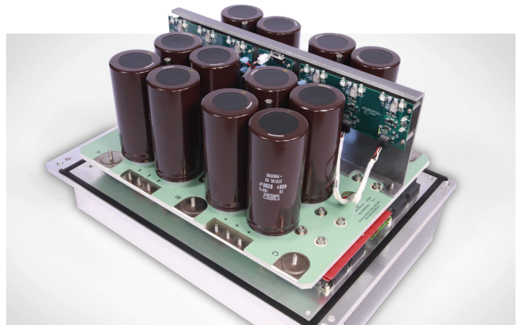
An upgraded replacement inverter from PSI Repair Services.

Need more peace-of-mind? Xantrex Matrix Inverters repaired and replaced by PSI have been rigorously field tested with successful results. Plus, PSI provides custom crating for all inverters to secure them from damage during shipping. Our inverter crates are also perfect for long term storage and return shipments of damaged cores. Give PSI a call today at 800-325-4774.